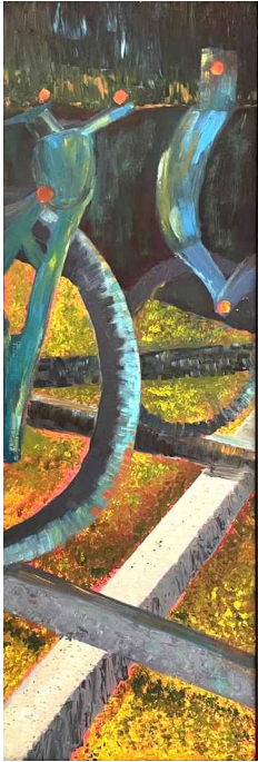
Engineering In Blue Sylvia Lynam