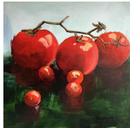
Red Skins Wendy Horne