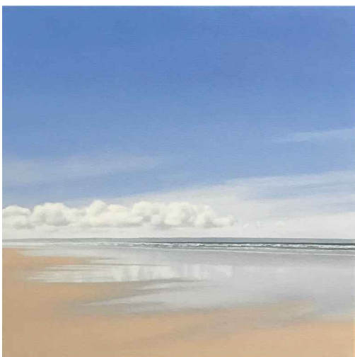
Reflected Clouds Helen Long